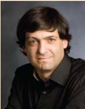
Dan Ariely, Leading Behavioural Economist & Author

Terry O'Reilly, the IBC speaker at last year's NICC conference, was a great success and we knew he would be a hard act to follow in 2010. But after a thorough search of high-profile speakers who have something relevant to relate to our industry, we have secured a speaker that is both relevant and irreverent. We believe he is capable of stepping up to – and perhaps raising - the bar that was set last year.