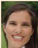
Dr. Kirsty Duncan , MP